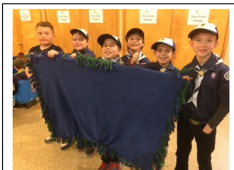
Making quilts for homeless kids

It's a kid-friendly and family-oriented place for us to meet and have fun together – just as we have been doing for more almost 60 years!